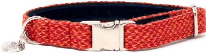
Rosehip & Purple - Barclay Design