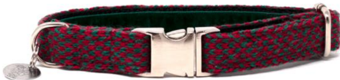
Rosehip & Sea Green - Harris Design