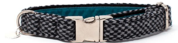
Black & Grey - Harris Design