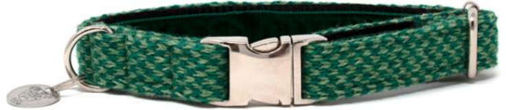
Sea Green & Green - Harris Design