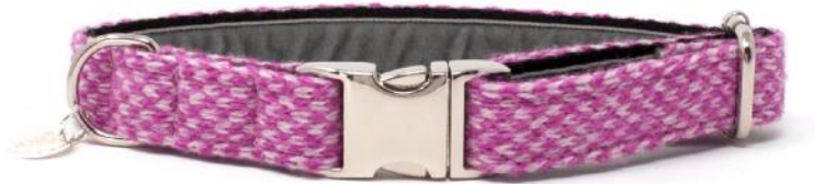
Pink & Dove - Harris Design