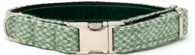
Green & Dove - Harris Design