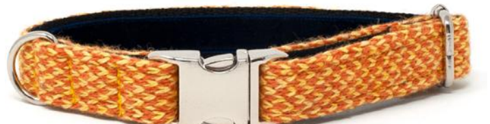
Yellow & Orange - Harris Design