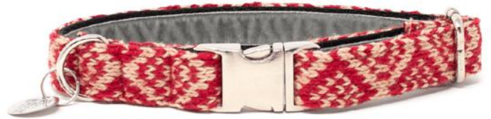
Rosehip & Tan - Barclay Design