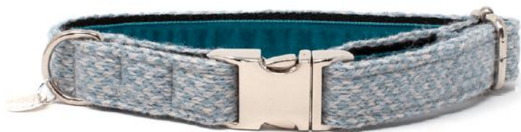
Ice Blue & Dove - Harris Design