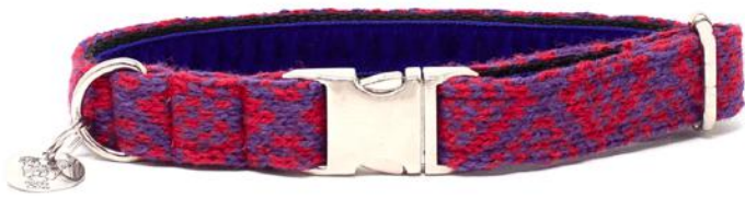
Rosehip & Purple - Barclay Design

6 Designs, available in all products and available until April 2022. Our seasonal collections feature limited edition yarn colours so we encourage wholesale customers to place orders in plenty of time.