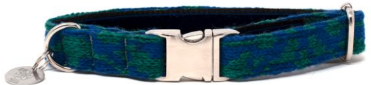
Sea Green & Navy - Kerr Design

Note: These designs are available for wholesale until the end of March 2022.