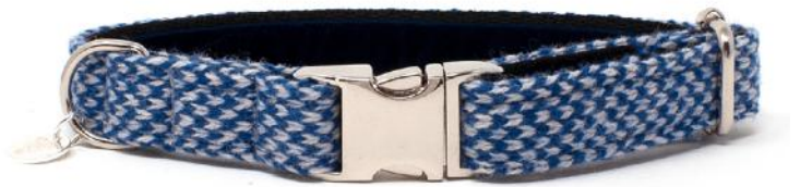
Navy & Dove - Harris Design