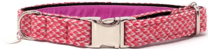
Geranium & Dove - Harris Design