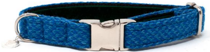
Royal Blue & Turquoise - Harris Design

Our best sellers from years of sales, the Classic Collection is a staple of the Stocky & Dee offering. Available in all products, these 8 designs are our most popular and the designs we suggest most new stockists to look at.